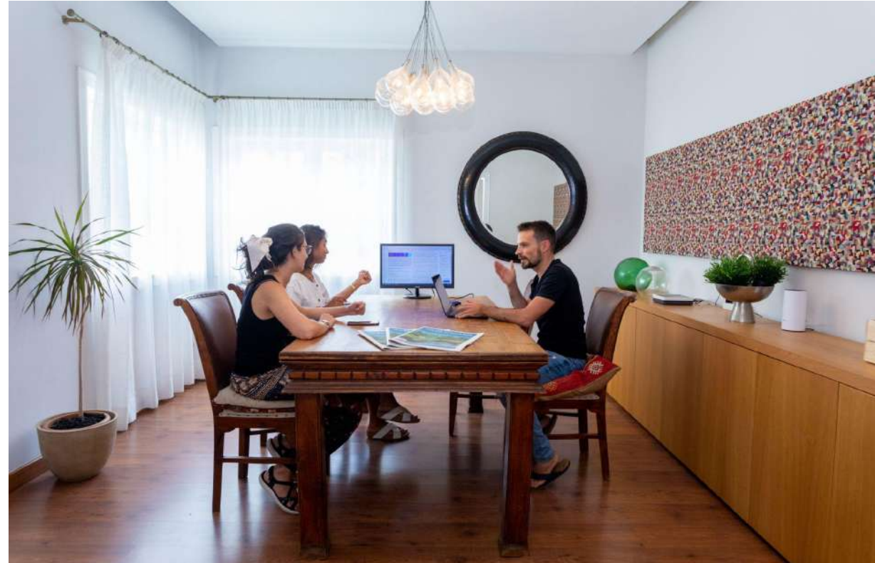
WORKING AREA Shared Space