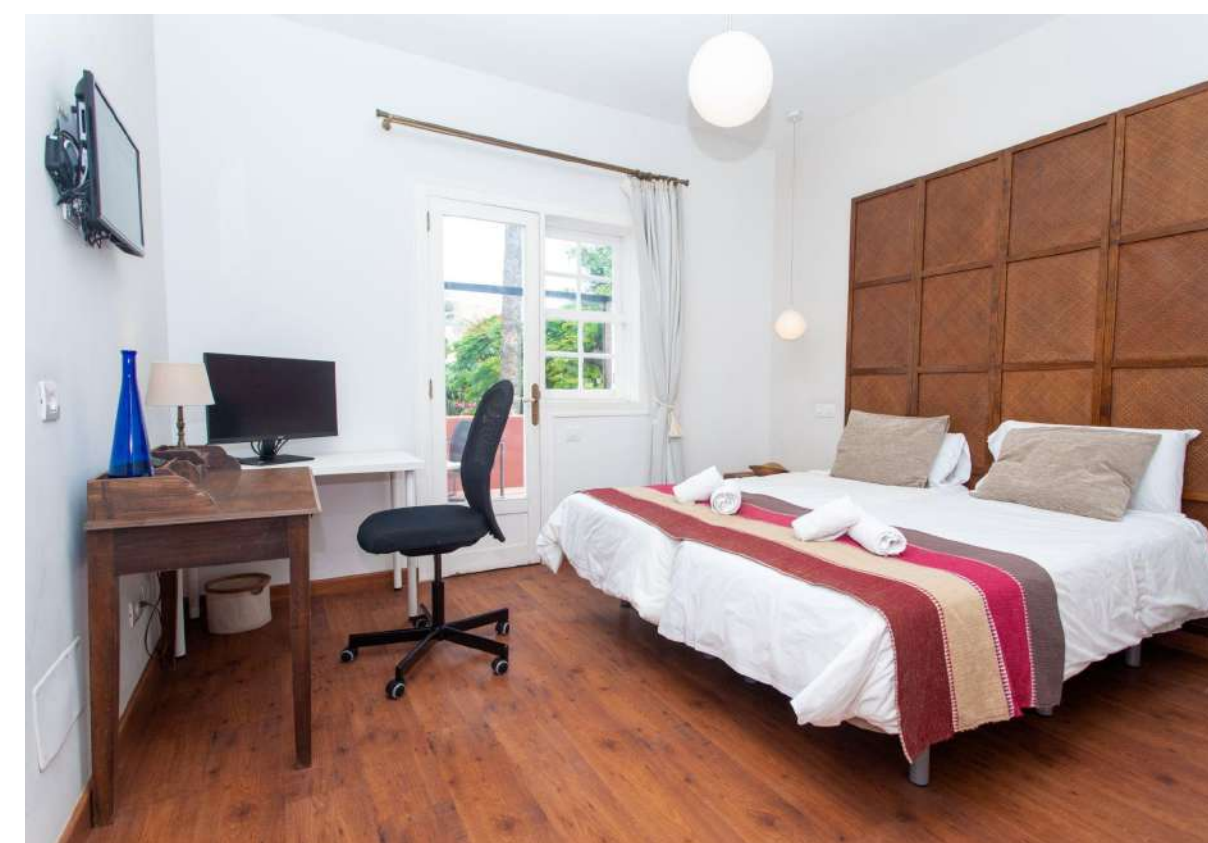
RE-ST ROOM Located on first floor. The Re-st room is equipped with a double bed, private bathroom and a desk. This room also has a private balcony.