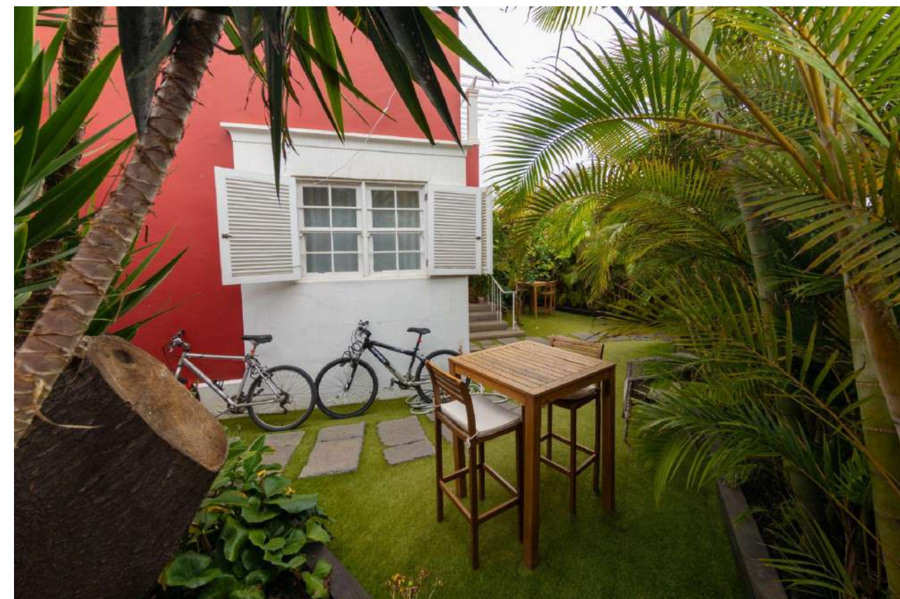
OUTDOOR PATIO Shared space with outdoor seating