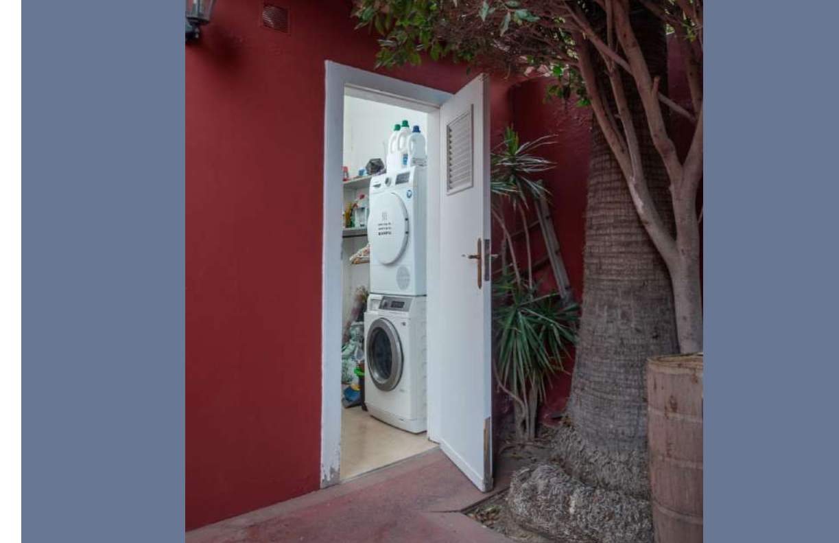
LAUNDRY ROOM Shared space