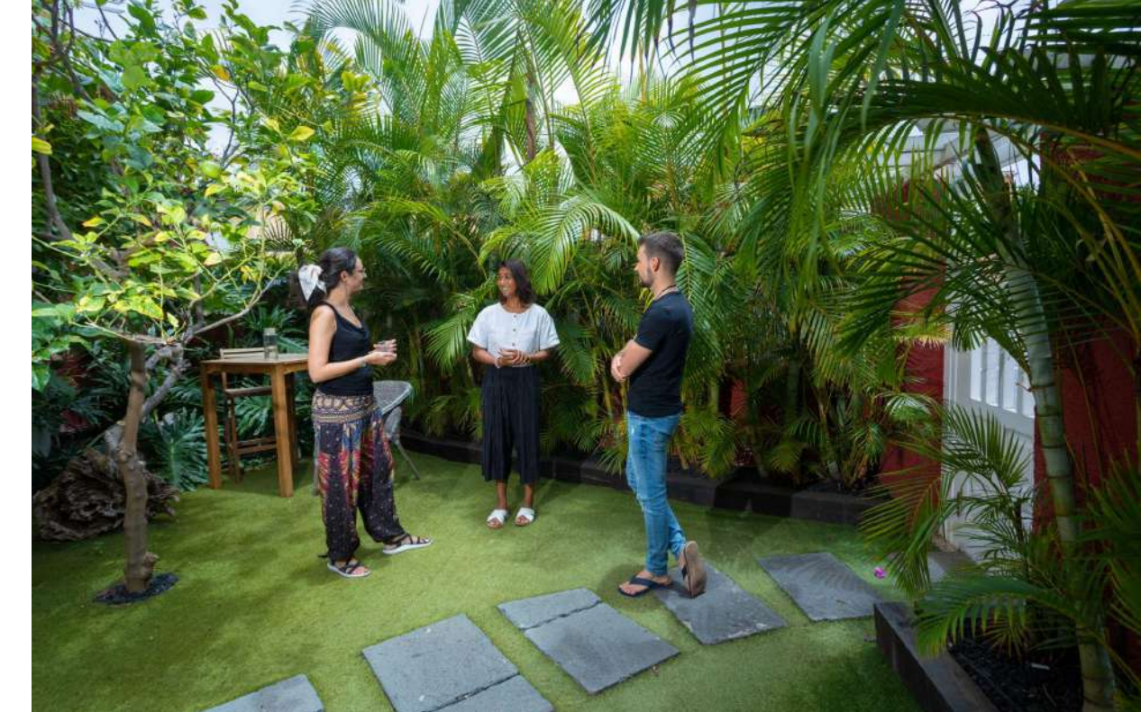
FRONT YARD Shared Space