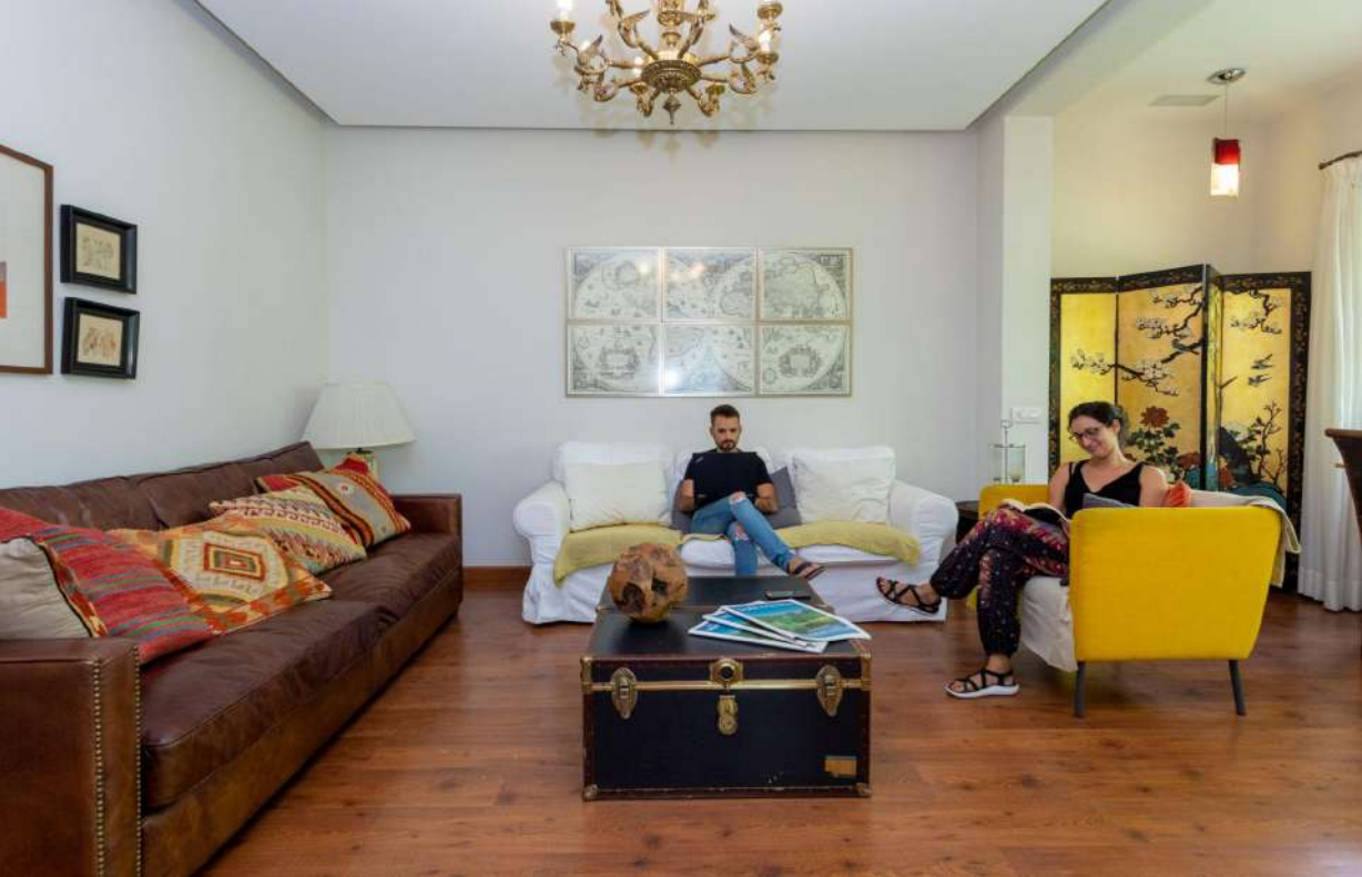
LIVING ROOM Shared space