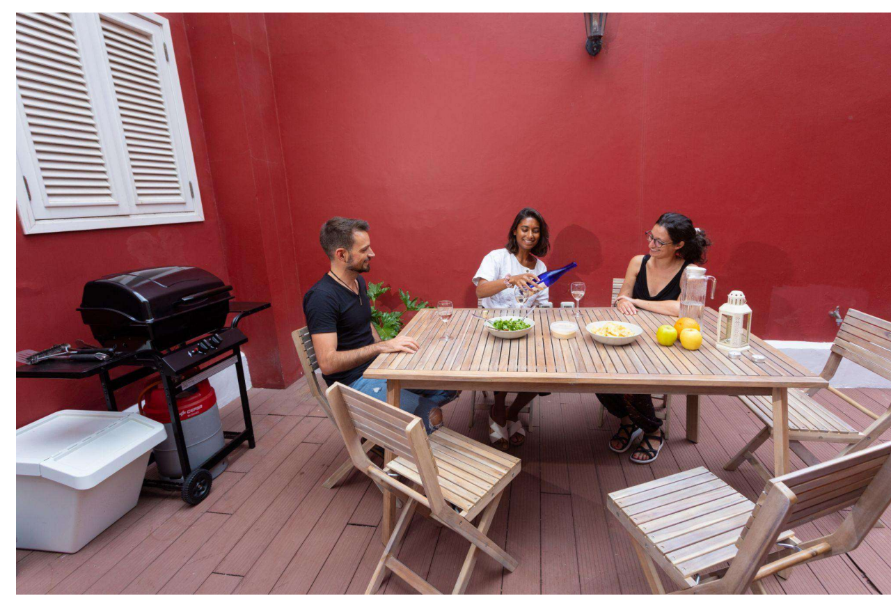
BACK YARD Shared space with outdoor dining and BBQ