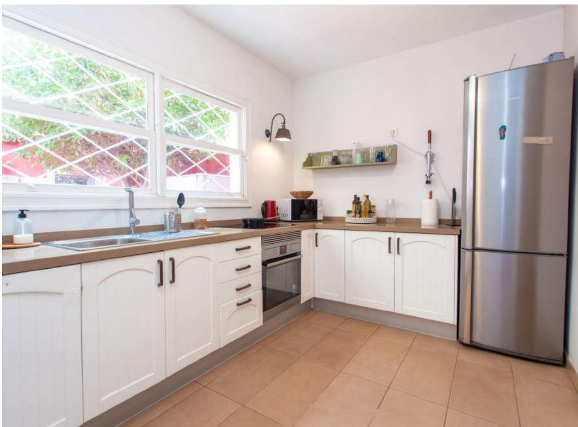
KITCHEN Shared space

Don't miss out on our Virtual 360 Tour ! As close as it gets as visiting our home 😊